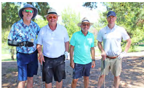
The first place foursome, and winners of the first-ever Doctors' Cup Trophy (the top all-physician group) from South Orange County Cardiology Group