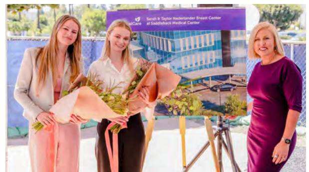
Recognizing the naming of the Sarah & Taylor Nederlander Breast Center at MemorialCare Saddleback Medical Center

The 40,000-square-foot Women's Health Pavilion is expected to open in 2023, directly across the street from the main hospital. A range of services dedicated to women's health will be offered under one roof, including a Community Education Center that will expand health and wellness educational offerings.