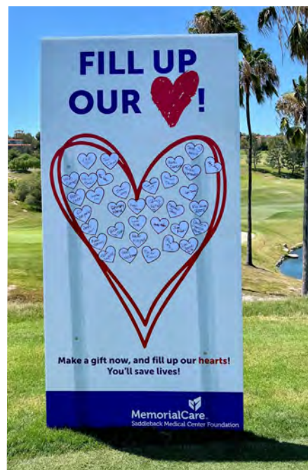
Our Fund-A-Need hole encouraged golfers to give directly to MemorialCare Heart & Vascular Institute to help purchase electrophysiology equipment for diagnosis of cardiac issues, support heart attack and stroke prevention education, and benefit our patient navigators.