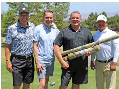
Among the golfers were hospital supporters, physicians, and sponsors, including Presenting Sponsor Team Alvarez Insurance Services (above).

Participants were elated to be returning after a three-year break, raising $101,000 to benefit heart health initiatives at Saddleback Medical Center.